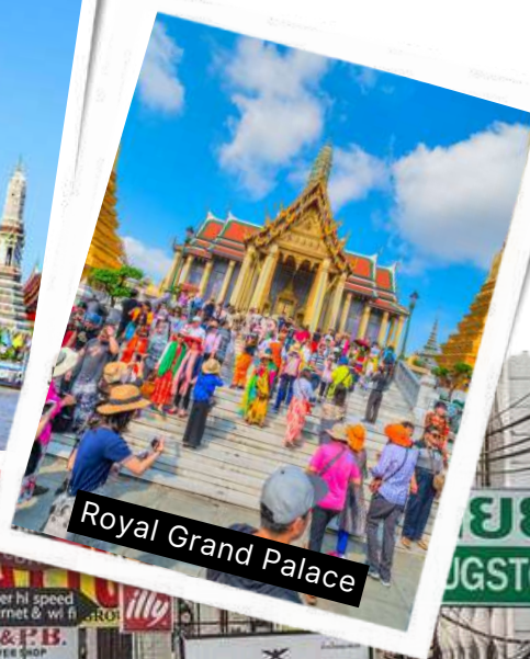
Royal Grand Palace